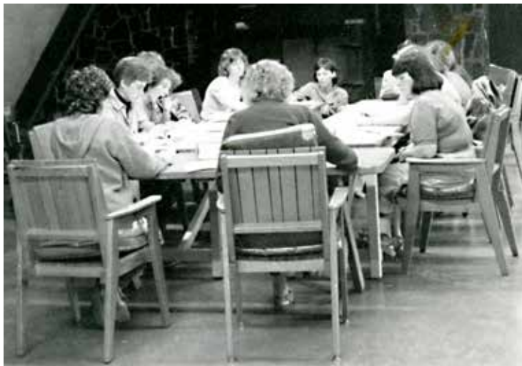
Class in the lodge, 1985