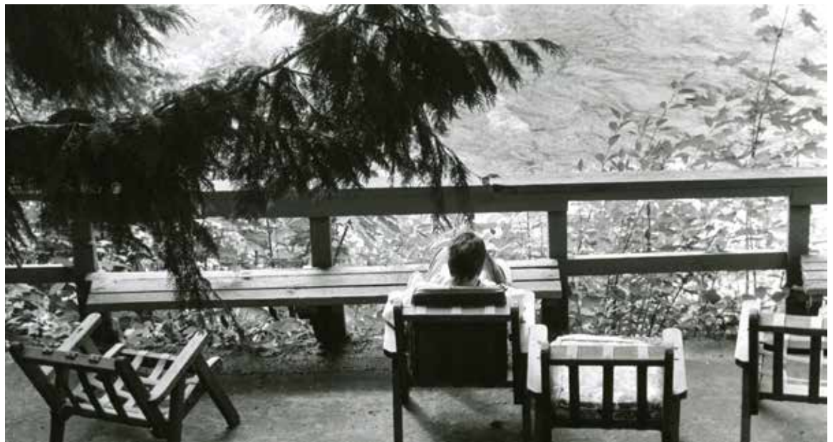
A woman writing on the terrace, 1985

"All that's gone on this week has extended the boundaries of my thinking—both as a woman and as a writer. It's such a luxury to be with women—such a diverse group, the stories we have, the lives we lead—nothing ordinary!"